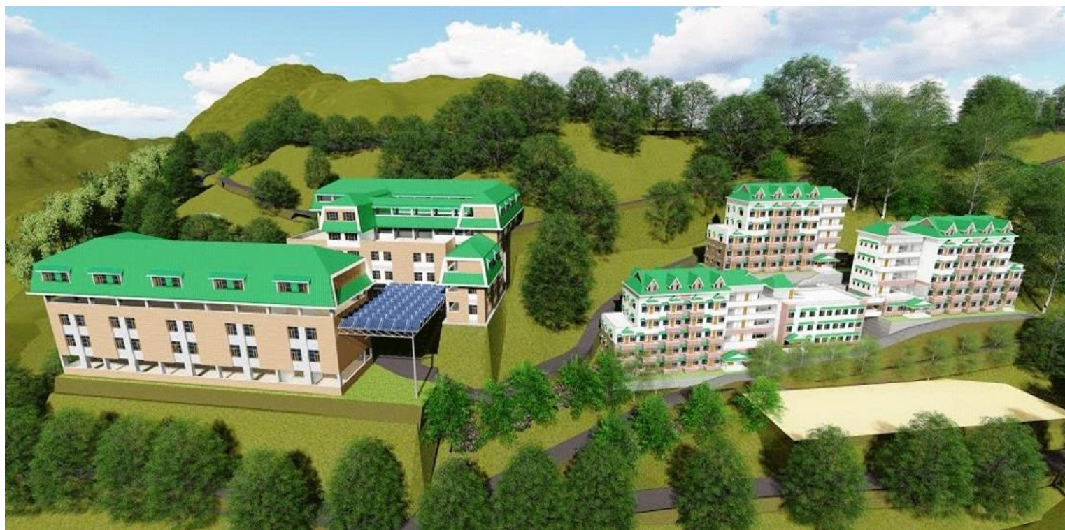
(3-D Image of HPNLU Under Construction Campus)