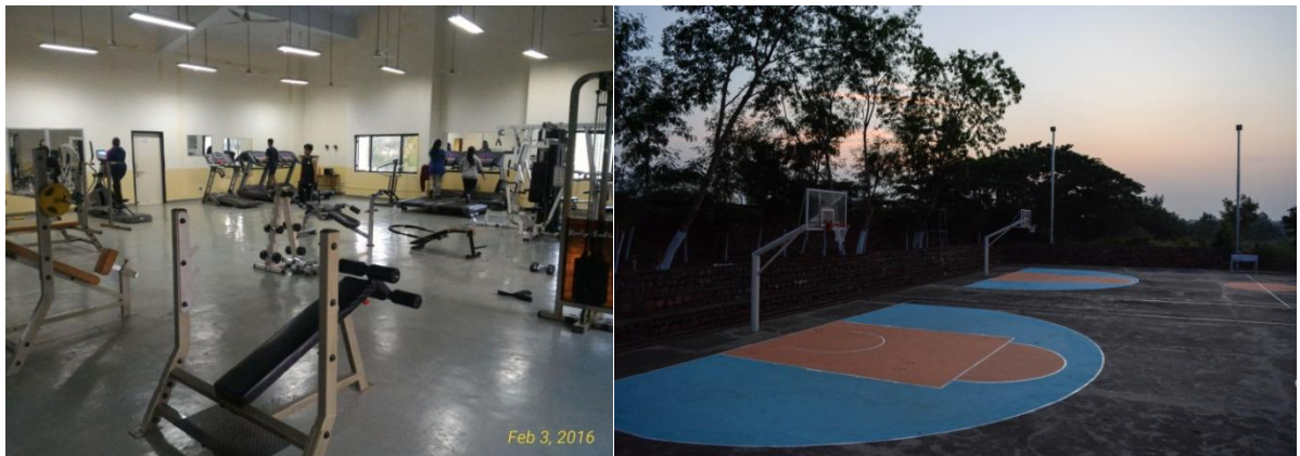
Gymnasium and Sports Facilities

All work and no play makes everyone a dull. Exercise of both mind and body is necessary to keep an individual healthy and fit. With a view to provide a congenial environment on the campus both indoor and outdoor sports facilities are available. Indoor facilities include state-of-the-art gymnasium, badminton courts, table tennis and pool game, outdoor facilities include tennis courts, volley ball courts and basket ball court.