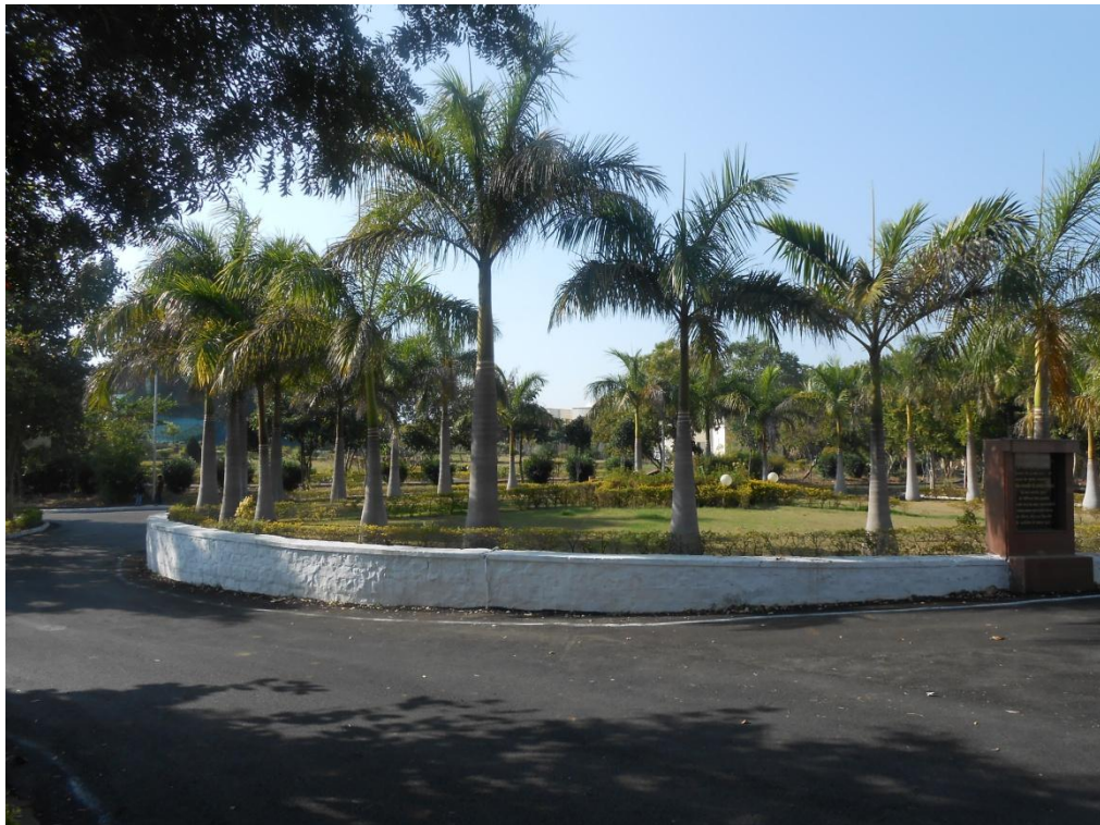
A View of the NLIU Campus